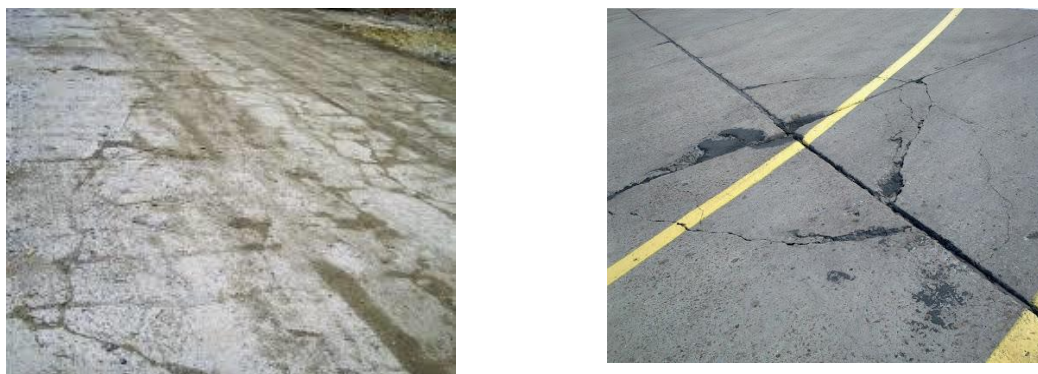
Figure 1. Cement concrete coating

roads is 15-20% more expensive, the service life is 2-3 times longer and maintenance costs are 3 times higher.[2] This is due to the complexity of the technology of preparation of cement concrete, the cost of portland cement. (PHD) According to D. Mahkamoav's research, in about 5 years, the operating costs of cement concrete and asphalt roads will be balanced. Cement concrete will increase its strength in 100 years, so our cement concrete roads can serve in good condition for 50 years. [3]